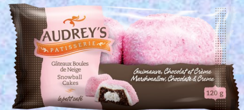
Snowball Cake 8pc 68207