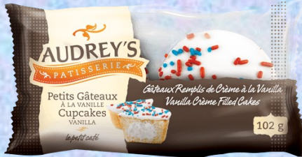
Vanilla Cupcakes 6pc 68206