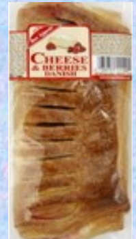
Cheese & Berries