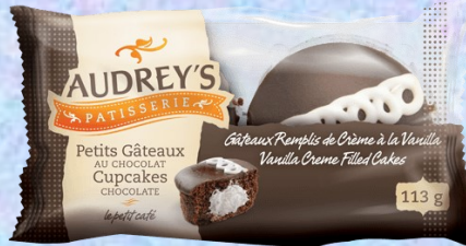
Chocolate Cupcake 6pc 8205