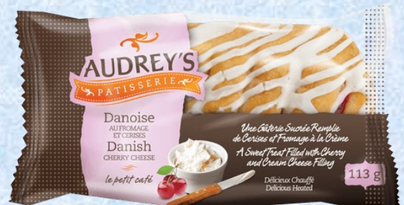
Cherry Cheese Danish 68604