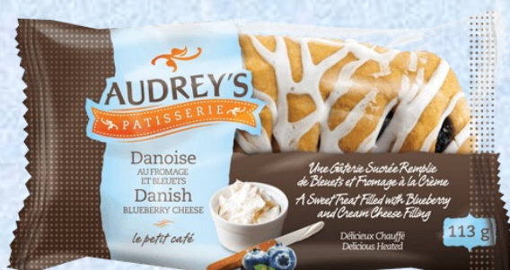
Blueberry Cheese Danish 68603