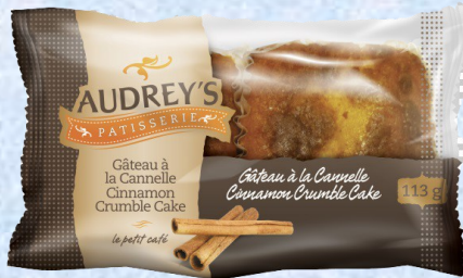
Cinnamon Crumble Cake 68601