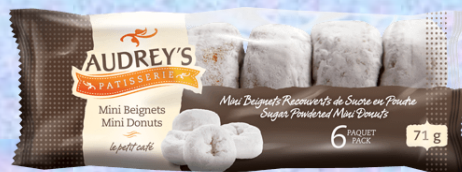
Mini Powdered Donuts 12pc 68204