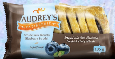
Blueberry Strudel 24pc 68274