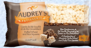
Puffed wheat & Crispy Square 68107