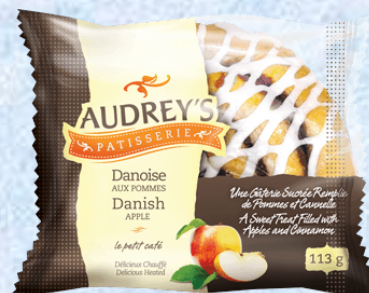
Apple Danish 68602