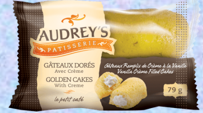
Golden Cakes 8pc 68202