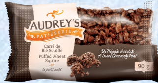
Puffed Wheat Square 68106