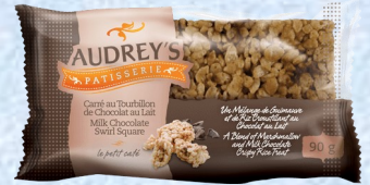
Chocolate Swirl Square 68108