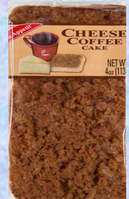
Cheese Coffee Cake