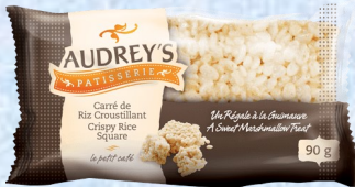
Rice Crispy Square 68105