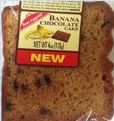
Banana Chocolate Cake