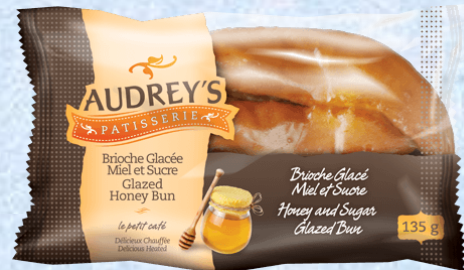
Glazed Honey Bun 68200