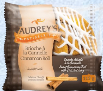
Cinnamon Roll 68606