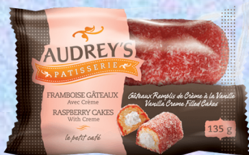
Raspberry Cake 8pc 68203