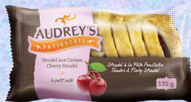
Cherry Strudel 24pc 68272