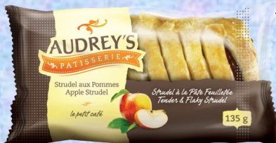
Apple Strudel 24pc 68273